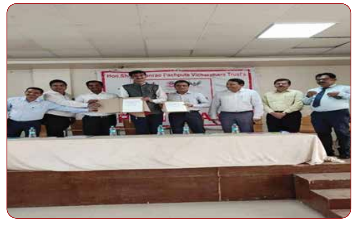
MOU between AISSMS and PARIKRAMA College